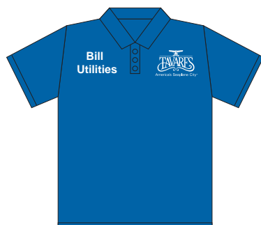
Royal Blue Shirt/White Logo Name & Department - Arial White