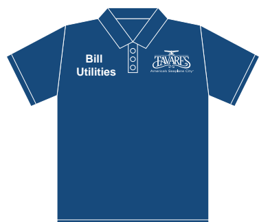
Navy Shirt/White Logo Name & Department - Arial White