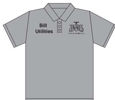
Grey Shirt/Black Logo Name & Department - Arial Black