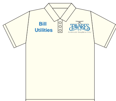
Cream Shirt/Blue & Silver Logo Name & Department - Arial Blue