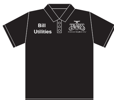
Black Shirt/White Logo Name & Department - Arial White