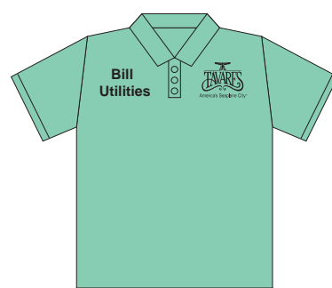
Light Green Shirt /Black Logo Name & Department - Arial Black