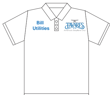
White Shirt/Blue & Silver Logo Name & Department - Arial Blue

Most graphic and shirt companies in Tavares have been provided with the appropriate City logos. If your vendor of choice needs the official logos, contact the Public Communications Department.