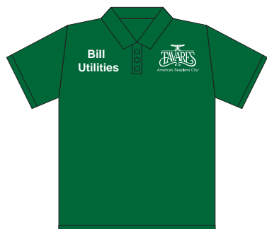
Dark Green Shirt/White Logo Name & Department - Arial White