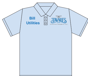
Light Blue Shirt/Blue & Silver Logo Name & Department - Arial Blue