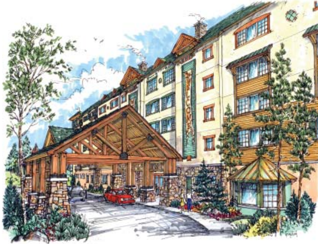
Artist's rendering of Osprey Lodge

Both of these construction projects benefitted from the City's business incentives by waiver of impact fees, conduit financing, or the postponement of other fees. By waiving startup fees, new businesses are able to get up and running quickly, offer a return to the City in the way of jobs, new property taxes and future utility revenues.